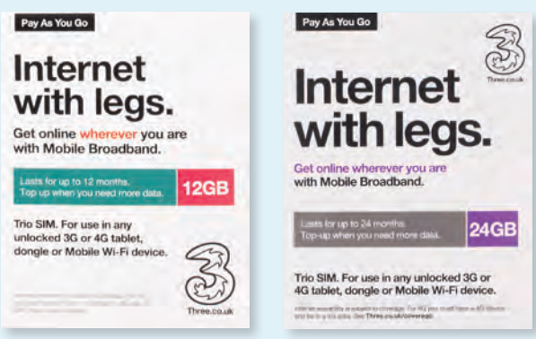
Three<sup>™</sup> is a registered trademark.

When you have used all the data, just add more using the Three website or replace with another pre-loaded data SIM. These SIM cards can also be used in many other countries at no extra cost but there are limitations. For full details of these limitations, please contact Three™.